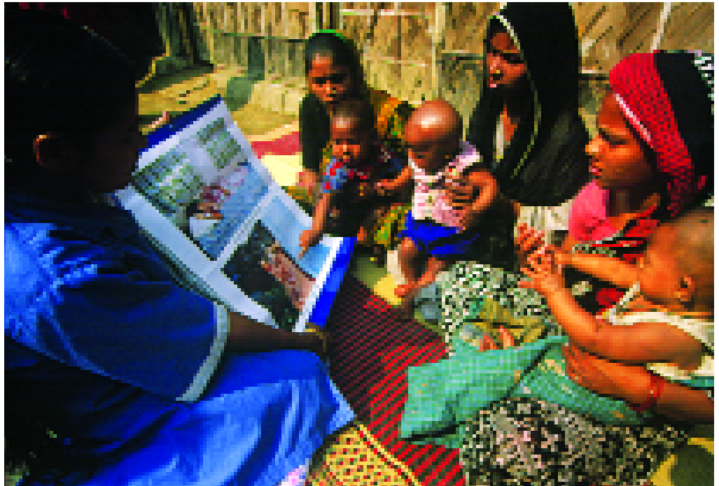
Providing family planning choices, Bangladesh