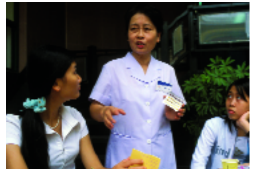
Demonstrating contraceptive methods, Viet Nam