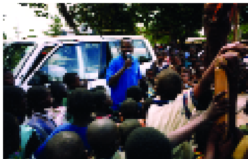
Reaching rural areas, Tanzania